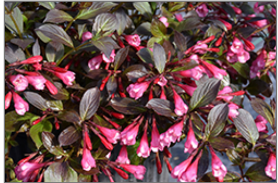
Very Fine Wine Weigela flowers