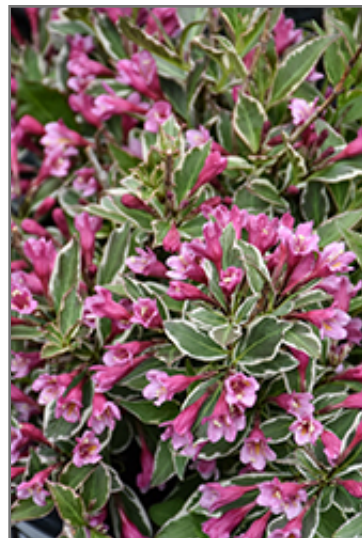
My Monet Purple Effect Weigela flowers

My Monet Purple Effect Weigela is recommended for the following landscape applications;