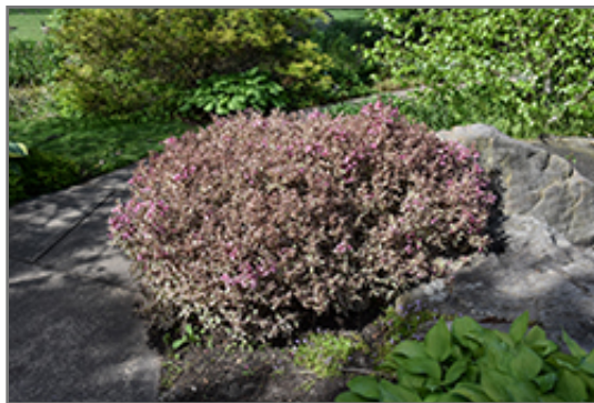
My Monet Purple Effect Weigela in bloom