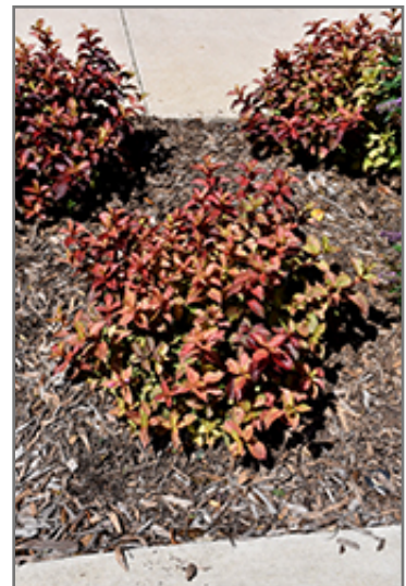
Midnight Sun Reblooming Weigela

8424 Farley St. Overland Park, KS 66212 913.642.6503