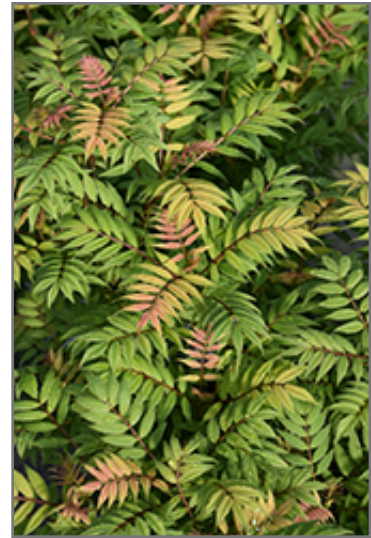
Mr. Mustard False Spirea foliage