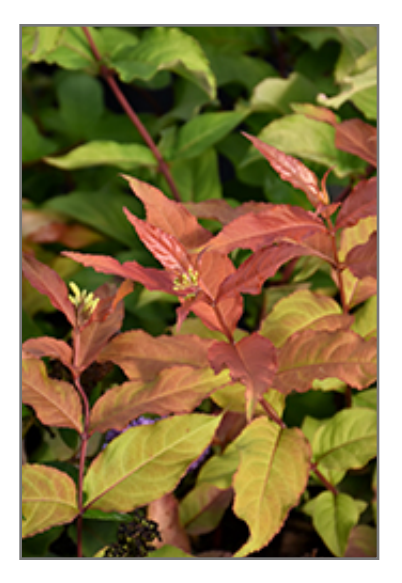
Kodiak Fresh Diervilla foliage

Kodiak Fresh Diervilla is a dense multi-stemmed deciduous shrub with a mounded form. Its average texture blends into the landscape, but can be balanced by one or two finer or coarser trees or shrubs for an effective composition.