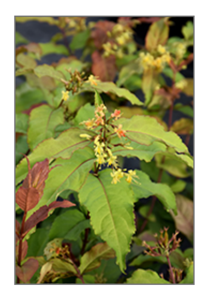
Kodiak Fresh Diervilla flowers

8424 Farley St. Overland Park, KS 66212 913.642.6503