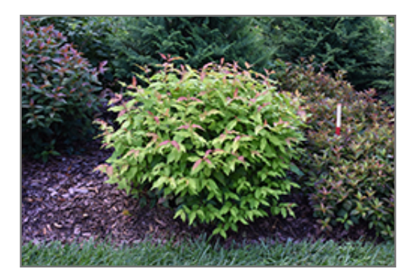
Kodiak Fresh Diervilla

Kodiak Fresh Diervilla makes a fine choice for the outdoor landscape, but it is also well-suited for use in outdoor pots and containers. Because of its height, it is often used as a 'thriller' in the 'spiller-thriller-filler' container combination; plant it near the center of the pot, surrounded by smaller plants and those that spill over the edges. It is even sizeable enough that it can be grown alone in a suitable container. Note that when grown in a container, it may not perform exactly as indicated on the tag - this is to be expected. Also note that when growing plants in outdoor containers and baskets, they may require more frequent waterings than they would in the yard or garden.