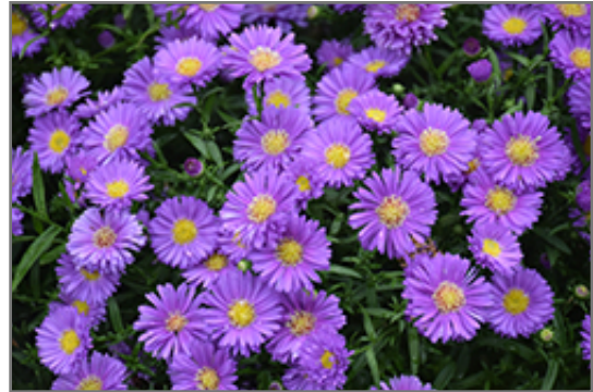
Magic Purple Aster flowers

Magic Purple Aster is recommended for the following landscape applications;