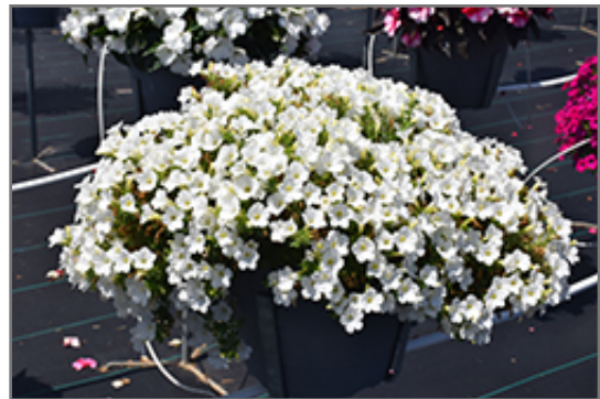
Itsy White Petunia in bloom