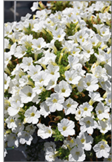
Itsy White Petunia flowers

This plant will require occasional maintenance and upkeep. Trim off the flower heads after they fade and die to encourage more blooms late into the season. It is a good choice for attracting bees, butterflies and hummingbirds to your yard, but is not particularly attractive to deer who tend to leave it alone in favor of tastier treats. It has no significant negative characteristics.