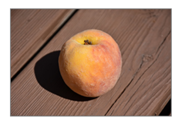
Honey Babe Peach fruit

830 W Liberty Dr. Liberty, MO 64068 816.781.0001