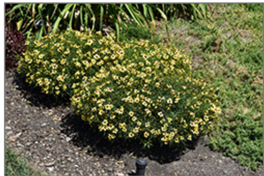
Sizzle And Spice Sassy Saffron Tickseed in bloom