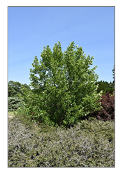
Little Volunteer Tuliptree

830 W Liberty Dr. Liberty, MO 64068 816.781.0001