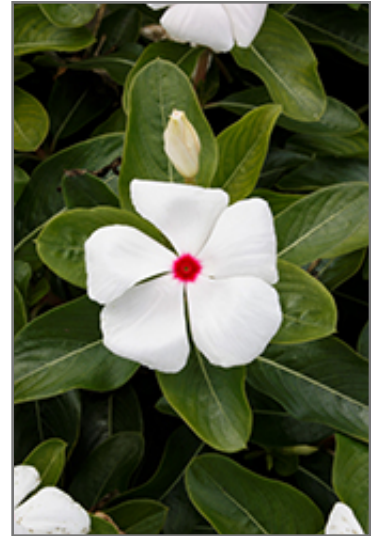
Cora Cascade Polka Dot Vinca flowers

Cora Cascade Polka Dot Vinca is recommended for the following landscape applications;