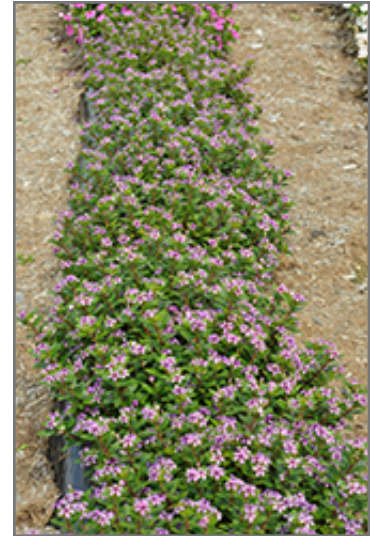
Soiree Kawaii Blueberry Kiss Vinca in bloom

Soiree Kawaii Blueberry Kiss Vinca will grow to be about 10 inches tall at maturity, with a spread of 18 inches. Its foliage tends to remain low and dense right to the ground. Although it's not a true annual, this fast-growing plant can be expected to behave as an annual in our climate if left outdoors over the winter, usually needing replacement the following year. As such, gardeners should take into consideration that it will perform differently than it would in its native habitat.