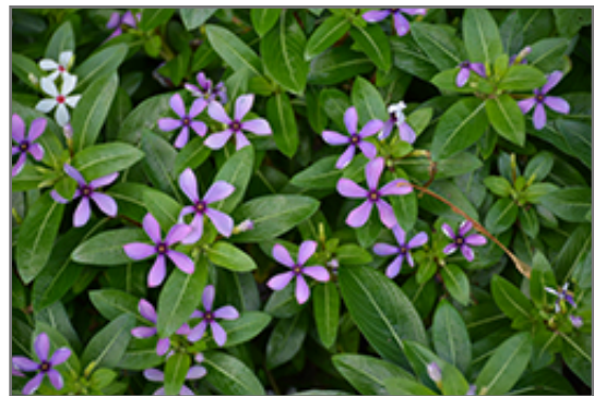
Soiree Kawaii Blueberry Kiss Vinca flowers