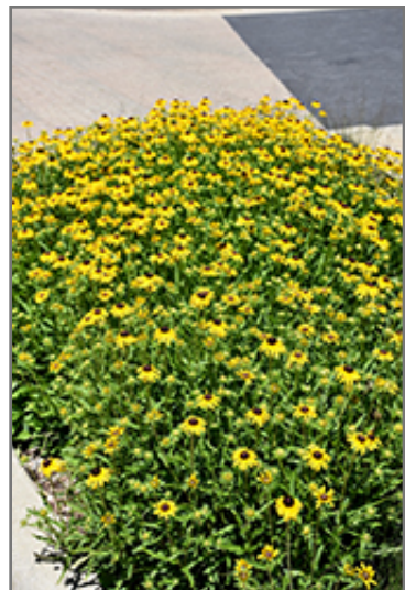
Viette's Little Suzy Coneflower in bloom