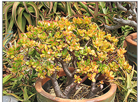
Sunset Jade Plant