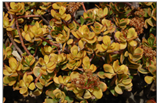
Hummel's Sunset Golden Jade Plant foliage