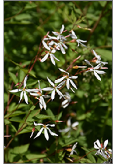
Bowman's Root flowers

This plant will require occasional maintenance and upkeep, and should be cut back in late fall in preparation for winter. It is a good choice for attracting bees and butterflies to your yard. It has no significant negative characteristics.