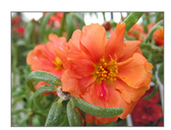
Happy Hour Orange Portulaca flowers