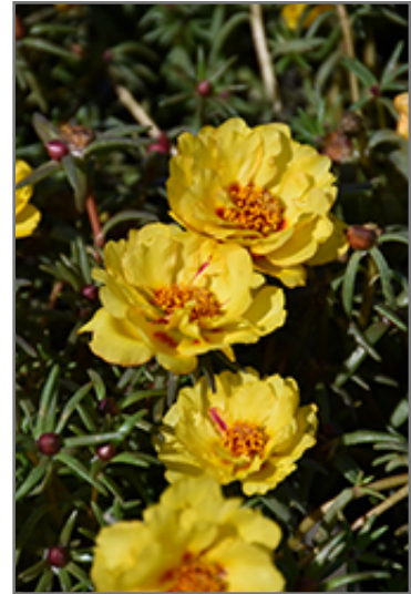
Happy Hour Banana Portulaca flowers

Happy Hour Banana Portulaca is recommended for the following landscape applications;