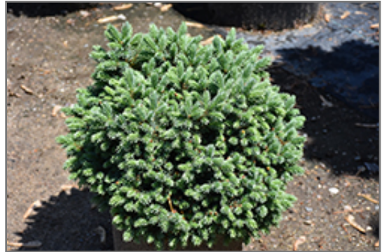
Jasper Engelmann Spruce