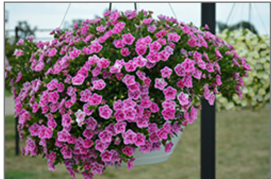
Superbells Doublette Love Swept Calibrachoa in bloom

8424 Farley St. Overland Park, KS 66212 913.642.6503