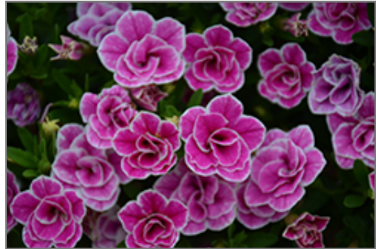
Superbells Doublette Love Swept Calibrachoa flowers

Superbells Doublette Love Swept Calibrachoa is a dense herbaceous annual with a trailing habit of growth, eventually spilling over the edges of hanging baskets and containers. Its medium texture blends into the garden, but can always be balanced by a couple of finer or coarser plants for an effective composition.