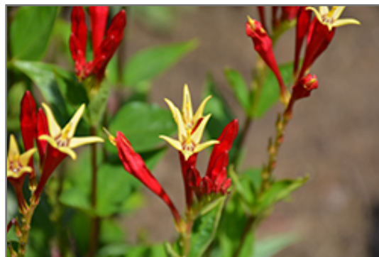
Little Redhead Indian Pink flowers