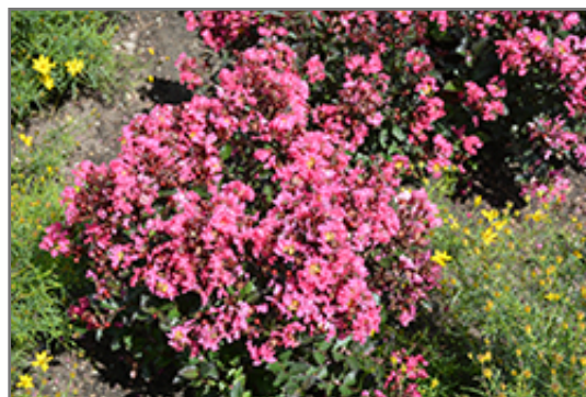
Barista Brew Ha Ha Crapemyrtle in bloom