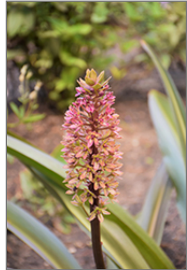
African Night Pineapple Lily flower buds

African Night Pineapple Lily is recommended for the following landscape applications;