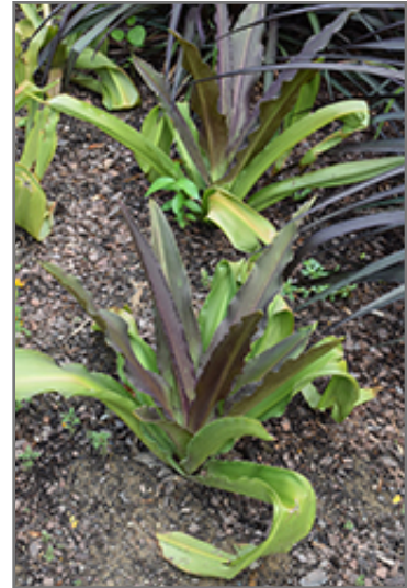
African Night Pineapple Lily

African Night Pineapple Lily is a fine choice for the garden, but it is also a good selection for planting in outdoor pots and containers. With its upright habit of growth, it is best suited for use as a 'thriller' in the 'spiller-thriller-filler' container combination; plant it near the center of the pot, surrounded by smaller plants and those that spill over the edges. It is even sizeable enough that it can be grown alone in a suitable container. Note that when growing plants in outdoor containers and baskets, they may require more frequent waterings than they would in the yard or garden.