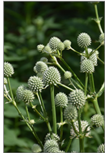
Rattlesnake Master flowers

This plant will require occasional maintenance and upkeep, and is best cleaned up in early spring before it resumes active growth for the season. It is a good choice for attracting bees and butterflies to your yard, but is not particularly attractive to deer who tend to leave it alone in favor of tastier treats. Gardeners should be aware of the following characteristic(s) that may warrant special consideration;