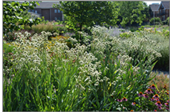
Rattlesnake Master in bloom

Rattlesnake Master is a fine choice for the garden, but it is also a good selection for planting in outdoor pots and containers. Because of its height, it is often used as a 'thriller' in the 'spiller-thriller-filler' container combination; plant it near the center of the pot, surrounded by smaller plants and those that spill over the edges. It is even sizeable enough that it can be grown alone in a suitable container. Note that when growing plants in outdoor containers and baskets, they may require more frequent waterings than they would in the yard or garden.