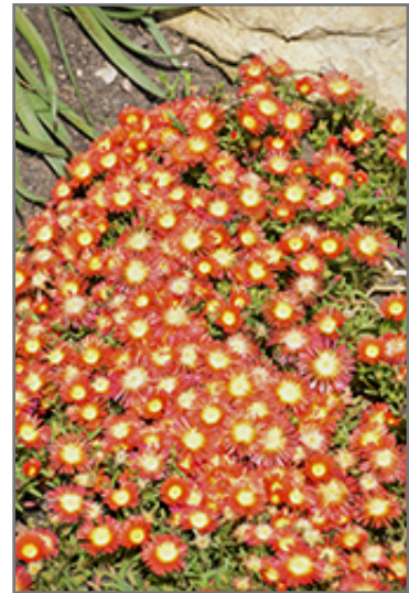
Delmara Red Ice Plant

This is a relatively low maintenance plant, and is best cleaned up in early spring before it resumes active growth for the season. It is a good choice for attracting bees and butterflies to your yard. It has no significant negative characteristics.