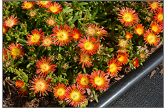
Delmara Red Ice Plant flowers

Delmara Red Ice Plant will grow to be only 4 inches tall at maturity extending to 6 inches tall with the flowers, with a spread of 15 inches. When grown in masses or used as a bedding plant, individual plants should be spaced approximately 12 inches apart. Its foliage tends to remain low and dense right to the ground. It grows at a fast rate, and under ideal conditions can be expected to live for approximately 5 years. As an evergreen perennial, this plant will typically keep its form and foliage year-round.