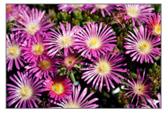
Delmara Pink Ice Plant flowers

830 W Liberty Dr. Liberty, MO 64068 816.781.0001