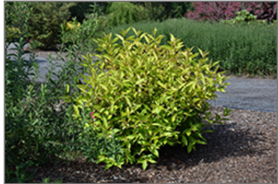
Golden Jackpot Weigela

Golden Jackpot Weigela makes a fine choice for the outdoor landscape, but it is also well-suited for use in outdoor pots and containers. Because of its height, it is often used as a 'thriller' in the 'spiller-thriller-filler' container combination; plant it near the center of the pot, surrounded by smaller plants and those that spill over the edges. It is even sizeable enough that it can be grown alone in a suitable container. Note that when grown in a container, it may not perform exactly as indicated on the tag - this is to be expected. Also note that when growing plants in outdoor containers and baskets, they may require more frequent waterings than they would in the yard or garden.