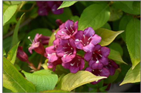
Golden Jackpot Weigela flowers

Golden Jackpot Weigela is recommended for the following landscape applications;