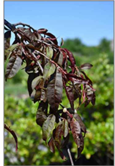
Crimson Cascade Weeping Peach foliage

This tree should only be grown in full sunlight. It does best in average to evenly moist conditions, but will not tolerate standing water. It is not particular as to soil type or pH. It is highly tolerant of urban pollution and will even thrive in inner city environments, and will benefit from being planted in a relatively sheltered location. This is a selected variety of a species not originally from North America.