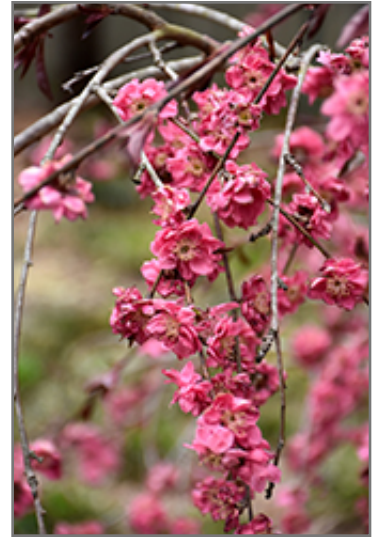
Crimson Cascade Weeping Peach flowers

Crimson Cascade Weeping Peach is recommended for the following landscape applications;