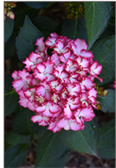
Seaside Serenade Fire Island Hydrangea flowers