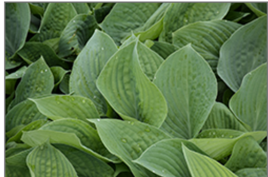
Blue Hawaii Hosta foliage