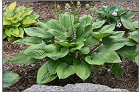
Blue Hawaii Hosta

Blue Hawaii Hosta is recommended for the following landscape applications;