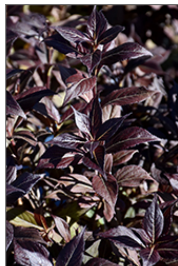
Date Night Stunner Weigela foliage

8424 Farley St. Overland Park, KS 66212 913.642.6503