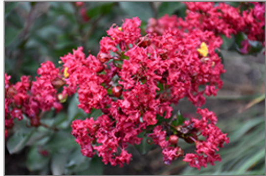
Barista Lava Java Crapemyrtle flowers

This is a relatively low maintenance shrub, and is best pruned in late winter once the threat of extreme cold has passed. It is a good choice for attracting bees to your yard, but is not particularly attractive to deer who tend to leave it alone in favor of tastier treats. It has no significant negative characteristics.