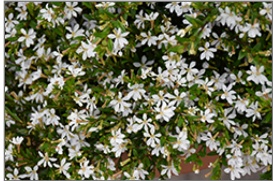
FloriGlory Maria Mexican Heather flowers

FloriGlory Maria Mexican Heather is recommended for the following landscape applications;