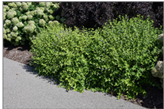
Sunshine Blue II Caryopteris in bloom

8424 Farley St. Overland Park, KS 66212 913.642.6503