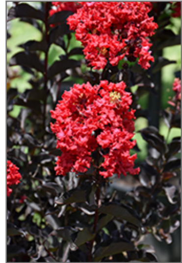
Ebony Fire Crapemyrtle flowers