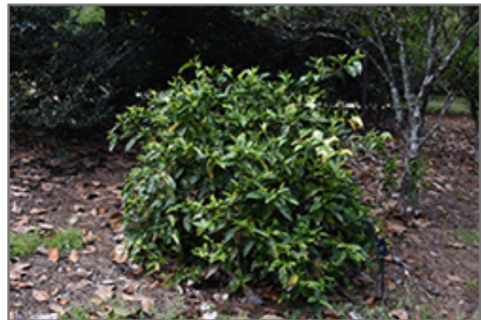
Yellow Tea Plant