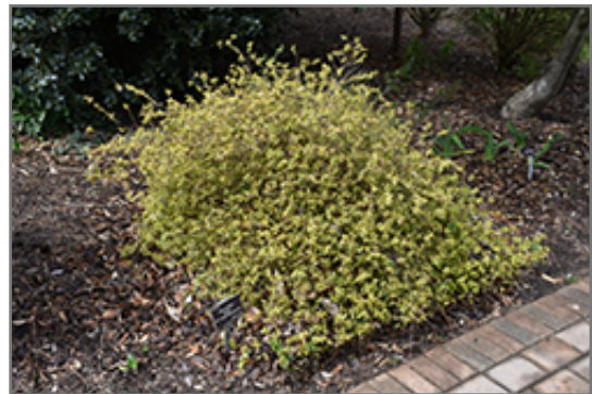
Twist of Orange Glossy Abelia