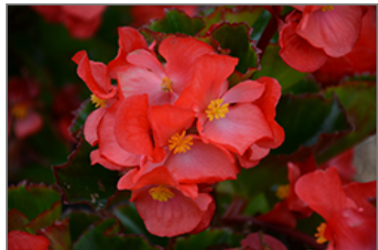
Megawatt Red Green Leaf Begonia flowers