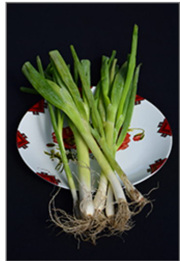
Spring Onion fruit