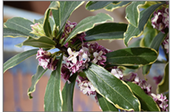
Moonlight Parfait Winter Daphne flowers