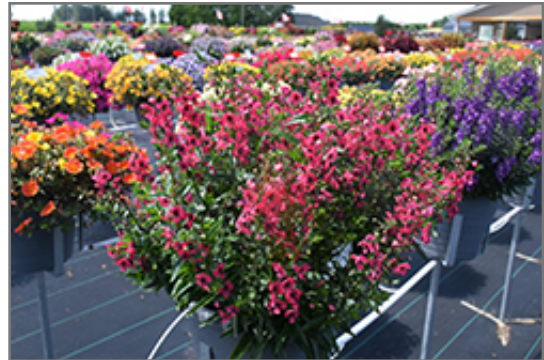
Archangel Cherry Red Angelonia in bloom