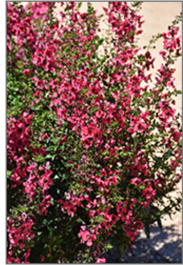
Archangel Cherry Red Angelonia flowers

Archangel Cherry Red Angelonia is an herbaceous annual with an upright spreading habit of growth. Its relatively fine texture sets it apart from other garden plants with less refined foliage.