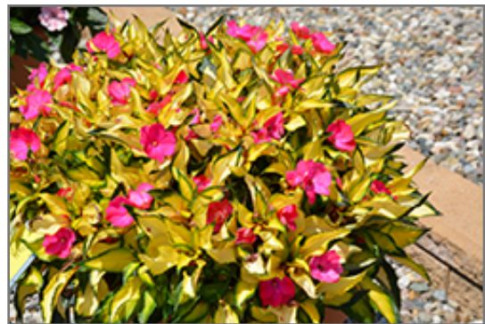
SunPatiens Compact Tropical Rose New Guinea Impatiens in bloom