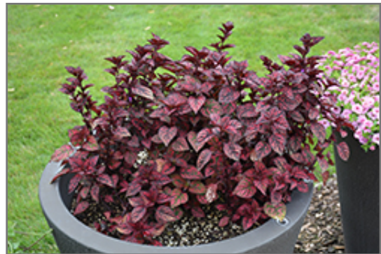
Hippo Red Polka Dot Plant