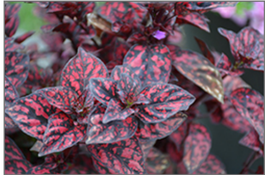
Hippo Red Polka Dot Plant foliage

Hippo Red Polka Dot Plant is recommended for the following landscape applications;