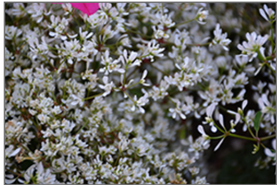
Diamond Delight Euphorbia flowers