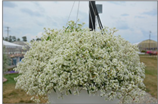
Diamond Delight Euphorbia in bloom

Diamond Delight Euphorbia is recommended for the following landscape applications;