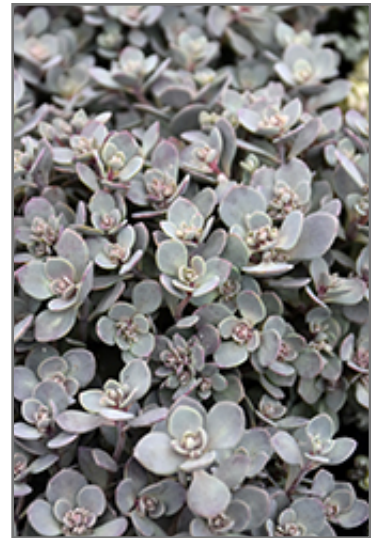
SunSparkler Blue Elf Sedoro foliage

SunSparkler Blue Elf Sedoro is a fine choice for the garden, but it is also a good selection for planting in outdoor pots and containers. Because of its spreading habit of growth, it is ideally suited for use as a 'spiller' in the 'spiller-thriller-filler' container combination; plant it near the edges where it can spill gracefully over the pot. Note that when growing plants in outdoor containers and baskets, they may require more frequent waterings than they would in the yard or garden.