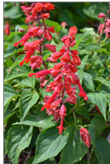
Saucy Red Salvia flowers

Saucy Red Salvia is recommended for the following landscape applications;