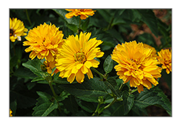
Summer Sun False Sunflower flowers

830 W Liberty Dr. Liberty, MO 64068 816.781.0001