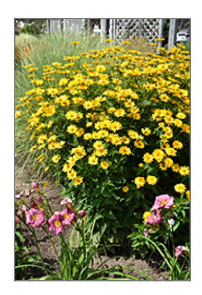
Summer Sun False Sunflower in bloom