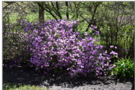
Compact Korean Azalea in bloom