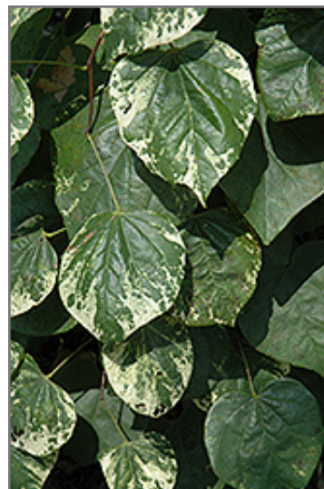
Whitewater Redbud foliage